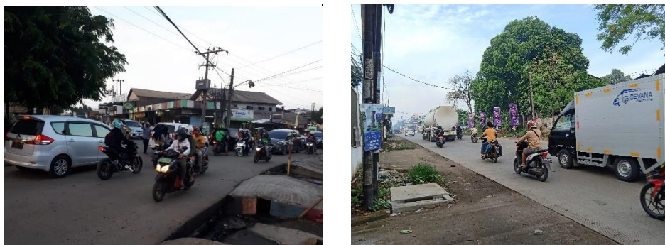
Fig 1. Research Locations for Intersections and Roads