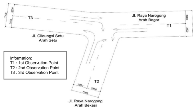
Fig 2. Illustration of Unmarked Intersection Jl. Cileungsi Setu - Jl. Raya Narogong