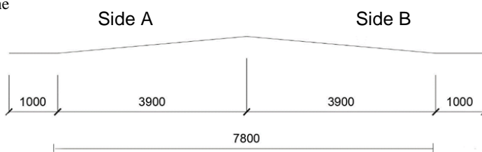
Fig 4. Front View of the Road Raya Narogong